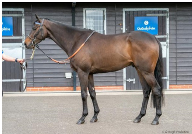
Ruling Planet: an exciting prospect

Each of these horses offers sporting potential, training transparency, and a personal ownership experience at Pant Wilkin.