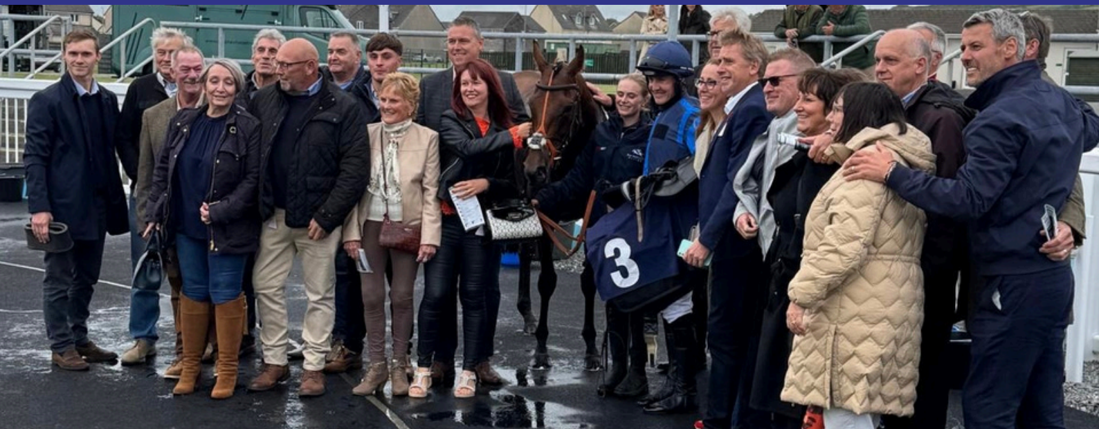
Reina Del Mar and lots of our Club Members celebrate after success