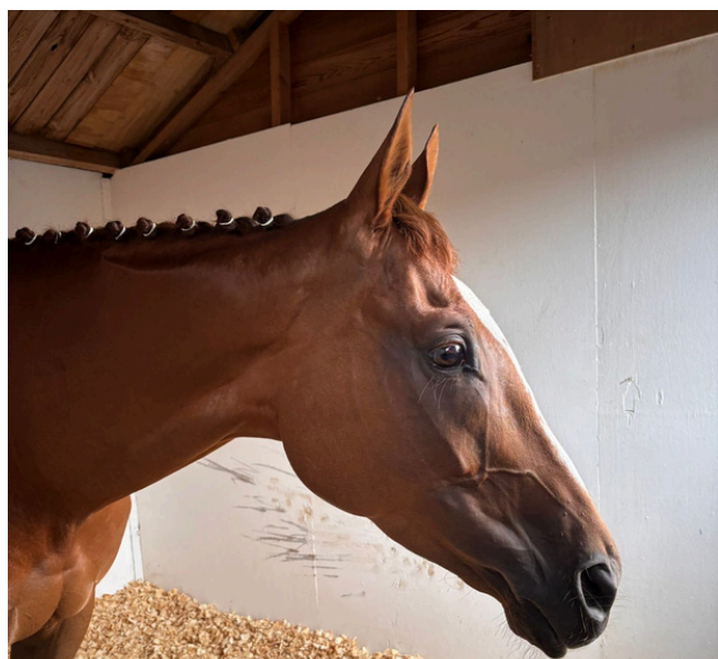
Bumpy chilling before his final victory for the yard

Bumpy Evans produced a bold, front-running win over fences at Cartmel, jumping beautifully and showing huge improvement. He was then sold at the Goffs Sales, where he became the top lot – a brilliant outcome and a great testament to the training journey he's been on. These successes reflect the fantastic effort across the team, from riders to farriers to stable staff and we're excited about the calibre of horses coming through.