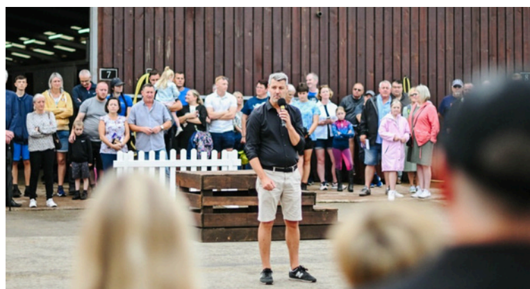
Last year's Open Day