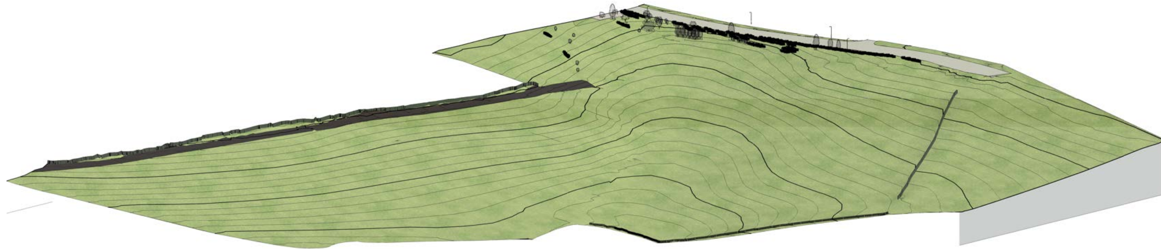
1 3D Existing